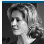
Martha Lane Fox CBE Executive Chair and Founder, Doteveryone.org.uk